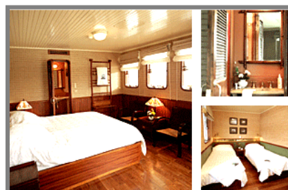
The Emeraude Cruise