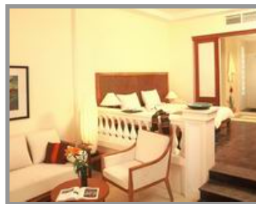
The Life Resort, Hoian