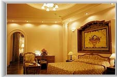
The Majestic, Saigon