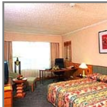
The Melia, Hanoi