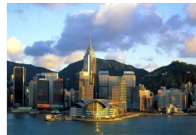
Photo stop at Expo Promenade (Wan Chai District) The imposing Golden Bauhinia standing on Expo Promenade outside the Hong Kong Convention and Exhibition Centre on the waterfront in Wan Chai marks the most significant occasion in Hong Kong’s history – the return of the former British colony to the People’s Republic of China, and the establishment of the Special Administrative Region of Hong Kong.

The Peak Coach transfer to the Peak Tram Station to ride the famous funicular railway to the top of famed Victoria Peak for the incredible harbour and city skyline. Here you can see a spectacular 360° view of Hong Kong. A glass of champagne will be served on the rooftop of The Peak Galleria. Evening Welcome Cocktail Reception “A Journey through Asia”. An Oriental extravaganza of the best of Asian cuisine and culture to be enjoyed in one evening. Discover the delicacies of Japan, the provincial dishes of China and explore Thailand, the land of smiles. Venture through the garden city of Singapore; sample the curries of India and the deliciously sweet desserts of the Philippines. National costumes, flowers, decorations and colourful performances of Eastern dances, acrobatics and craftsmen create the flavour and sounds of each country visited.